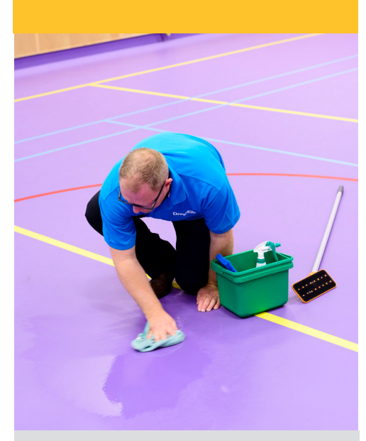
Wipe the spot dry with a microfibre cloth. If necessary, repeat steps 1 to 3.