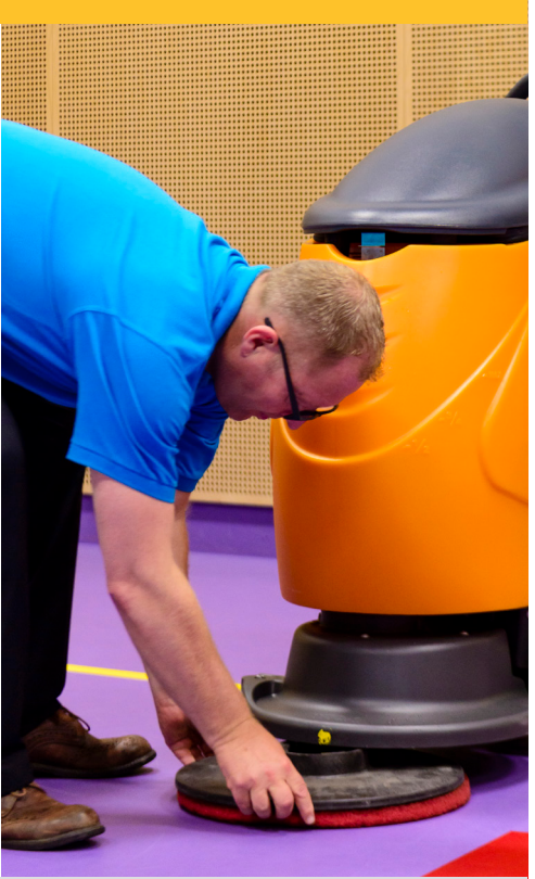
Attach the red pad underneath the scrubbing/suction machine.