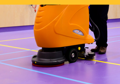
Let the machine suck up the fluid while scrubbing. Work at a slow walking pace.