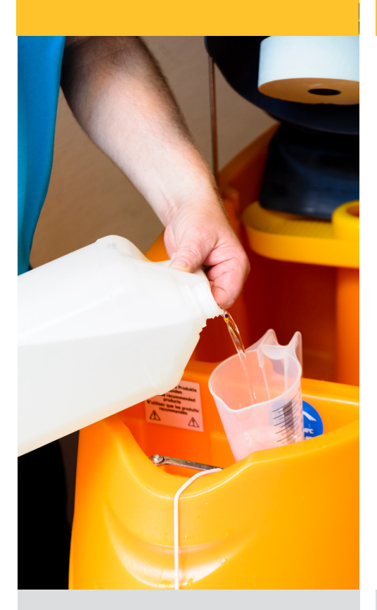
Measure the quantity of the cleaning product 50 ml product per 10 L water (1:200)