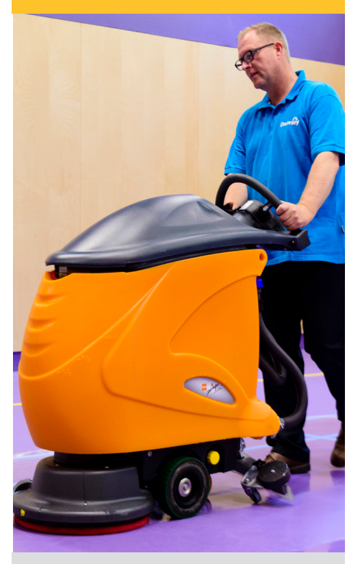
Apply the fluid while scrubbing and let the machine suck it up immediately. Work at a normal walking pace.